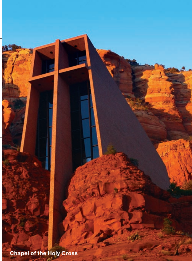
Chapel of the Holy Cross

9 Urban Mountains and Peaks Three popular Phoenix climbing spots drew multiple votes, led by Camelback Mountain, rising 2,700 feet above the Phoenix metropolitan area and resembling a camel at rest. Piestewa Peak, named for Lori Ann Piestewa, the first Native American woman to die in U.S. military combat, is 2,608 feet above sea level and is the second highest mountain in the area. South Mountain Park, the nation's largest municipal park, has 58 miles of hiking trails ranging from one to 14 miles.