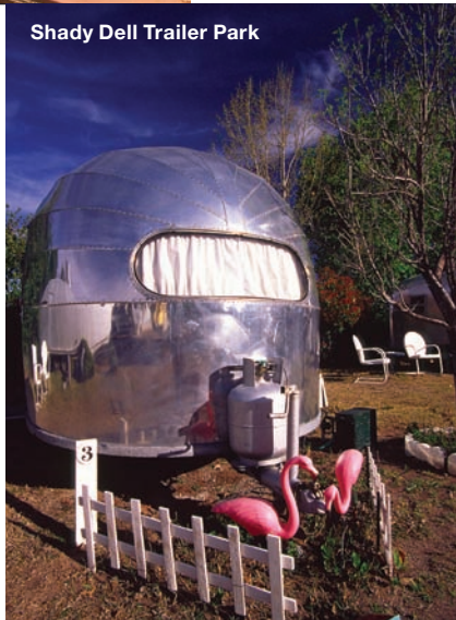
Shady Dell Trailer Park

For years, fans of the hit Eagles' tune "Take It Easy" would go to Winslow to stand on the corner. Today, there's an official Standin' On the Corner in Winslow Arizona Park, where corner-standers can stand without fear of standin' in the wrong place. There's just room enough for a mural, trees, and a life-size bronze statue of the young man holding his guitar. It's open 24 hours a day and there's no charge for picture-taking or just standin'.