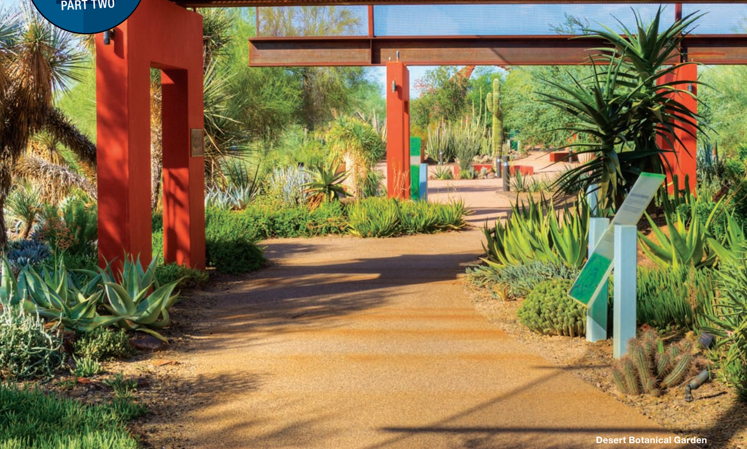
Desert Botanical Garden