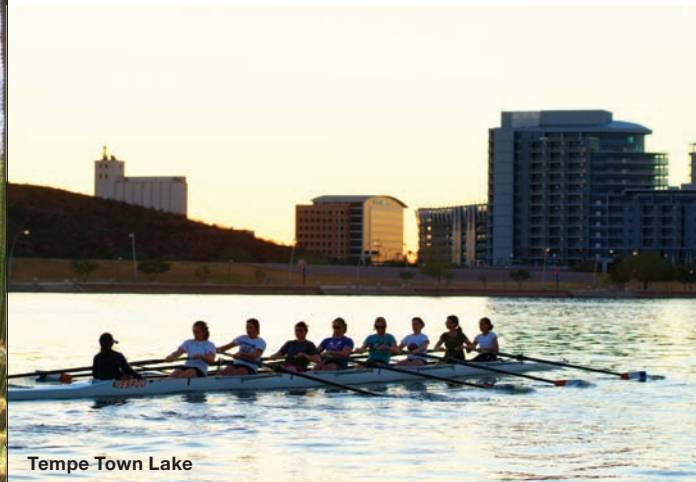
Tempe Town Lake

2 Arcosanti Since 1970, visionary architect Paolo Soleri has been working on his futuristic city in the desert north of Cordes Junction. The project may not be finished in this generation, or even the next, but when it's complete, it will be home to about 7,000 people living and working in a close-knit environment. There will be no cars allowed inside the complex and solar power will be the norm.