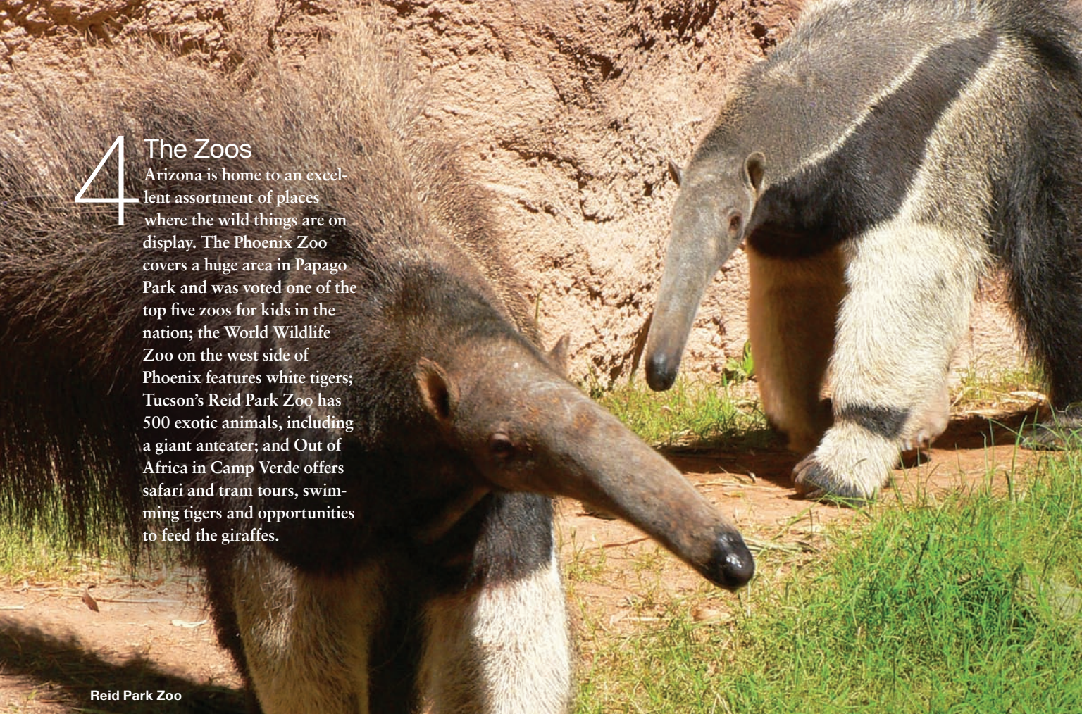
Reid Park Zoo

Arizona is home to an excellent assortment of places where the wild things are on display. The Phoenix Zoo covers a huge area in Papago Park and was voted one of the top five zoos for kids in the nation; the World Wildlife Zoo on the west side of Phoenix features white tigers; Tucson's Reid Park Zoo has 500 exotic animals, including a giant anteater; and Out of Africa in Camp Verde offers safari and tram tours, swimming tigers and opportunities to feed the giraffes.