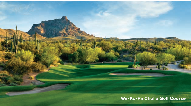
We-Ko-Pa Cholla Golf Course