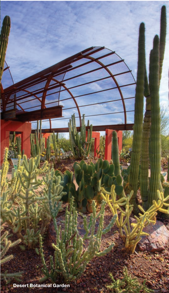
Desert Botanical Garden

1 Desert Botanical Garden Every year, more than 640,000 visitors wander the garden, nestled among the red rocks of Papago Park in Phoenix. The enclosure features about 50,000 displays of plants common to the deserts of the Southwest. Now in its 70th year, it is one of only 44 botanical gardens in the nation accredited by the American Association of Museums.